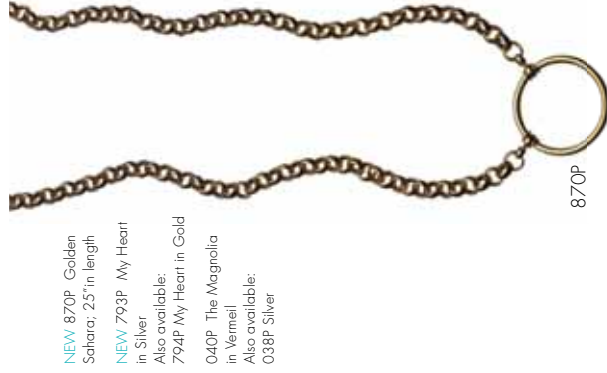
NEW 870P Golden Saltara; 25" in length