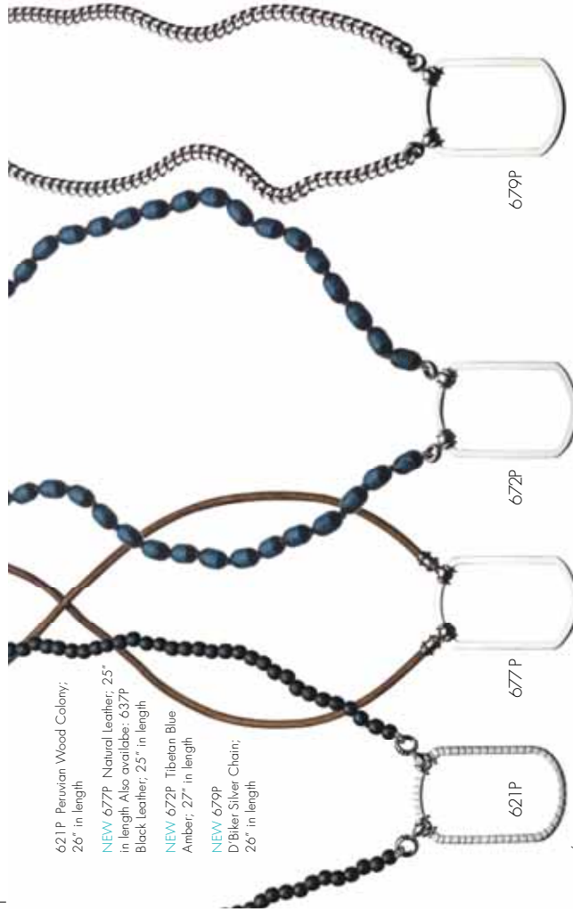
621P Peruvian Wood Colony; 26" in length